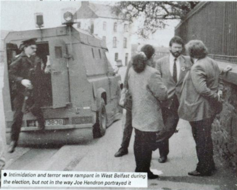
● Intimidation and terror were rampant in West Belfast during the election, but not in the way Joe Hendron portrayed it

Despite the dishonesty of these statements perhaps the most infuriating element of Hendron's defence was his attack on the West Belfast community itself. In court he and his legal representatives have described West Belfast as being rampant with 'terrorism' and 'intimidation' and that proper election conditions do not apply in this area. In doing so Hendron was pandering to a bigoted view of this area and blaming his own misbehaviour on the people of the area whose interests he claims to serve. This scandalous behaviour alone calls into question his suitability to represent this area.