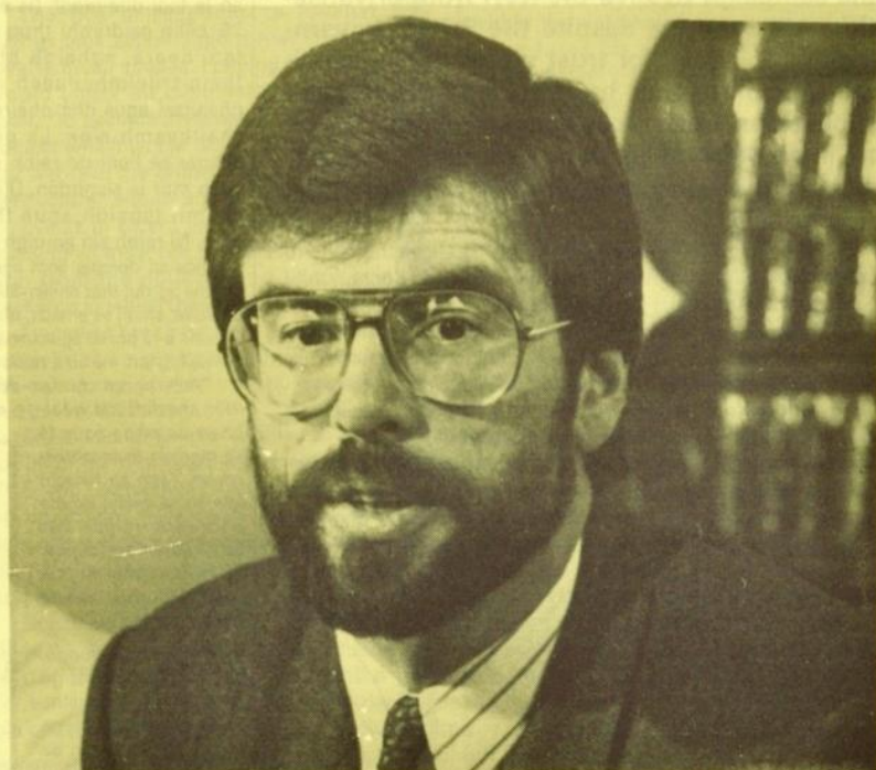
GERRY ADAMS MP

Sinn Féin Advice Centre Connolly House, Tel: 301939.