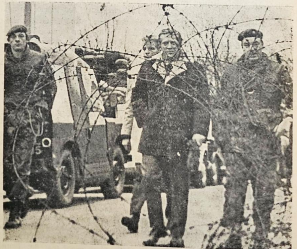
THE MEN WHO SHOULD BE BEHIND THE WIRE.

"Your Internee" appears, smiles and soon you are lost in conversation. He asks how you are keeping, how is the family, how are the people holding out. In your half an hour you answer as many questions as you possibly can. A half an hour, thirty minutes out of a total of 10,080 per week. In one year there are 524,160 minutes 522,600 of these are spent in loneliness, praying, worrying and longing for the release of "Your Internee." Your thoughts as they close the gate behind you as you leave "I wish it was next Thursday."