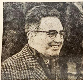
Ruairí Ó Brádaigh