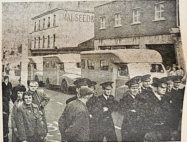
OCTOBER 5th 1968. THE FINAL ATTEMPT BY THE BRITISH INFLUENCED POLITICIANS TO EMPLOY THEIR AGE OLD DIVIDE AND CONQUER TACTICS.

Many organisations including the Republican Movement have called for a boycott of the plebiscite. We advocate that instead of a time wasting sectarian vote. Westminster keeps her nose out of our affairs and an all Ireland conference be held. Let the representatives of all parties put their questions and proposals to EACH OTHER and free from English influence, we undoubtedly could arrive at a solution agreeable to all. Not an imposed solution but a solution that we need.