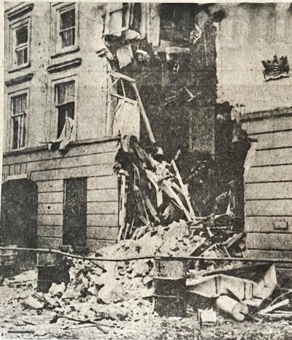
The Charlemont Arms Hotel in Armagh wrecked by a bomb left in the entrance.