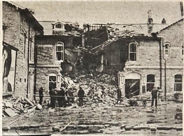
The extensively damaged Waterside railway station after the bomb blast on Monday afternoon.