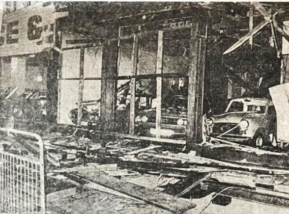
The car showroom in Great Victoria Street, Belfast, where new and used cars were destroyed by a bomb.