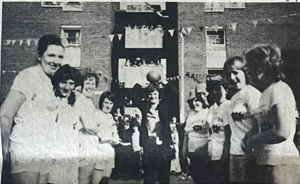
Ladies' football teams lining up.

knees a knocking until the dawn. I made it home just in time to get up for another day.