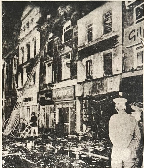
The devastated block of shops in Upper North Street, Belfast after the bombing.