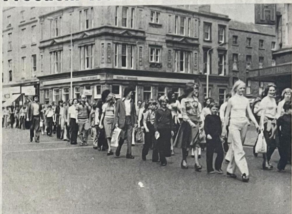
At 1.00 p.m. on Sunday the 6th of July, 1975, an enthusiastic crowd gathered at Donnell Square, Dublin for the Annual Freedom Walk held in aid of An Cumann Cabhrach. Young and old alike joined in the ten mile walk through Dublin to the Phoenix Park, where they were met by open-air entertainment. Our picture shows a section of the walkers.