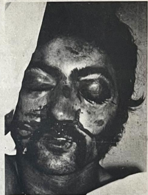
ONE OF MANY MEN ALMOST DEATH TO DEATH BY BRITISH TROOPS AFTER THE BURNING OF LONG KESH CONCENTRATION CAMPS ON THE 15th OCTOBER, 1974.