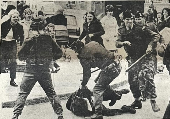
Scots Guards in brutal action ...

He emphasised that the action of members and units of Oglaihn na hÉireann is being and will be related to the level of violence of Crown forces and points, as evidence, to