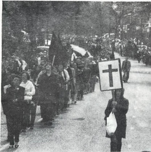
Black Flag Memorial March for Bobby Sands last Saturday