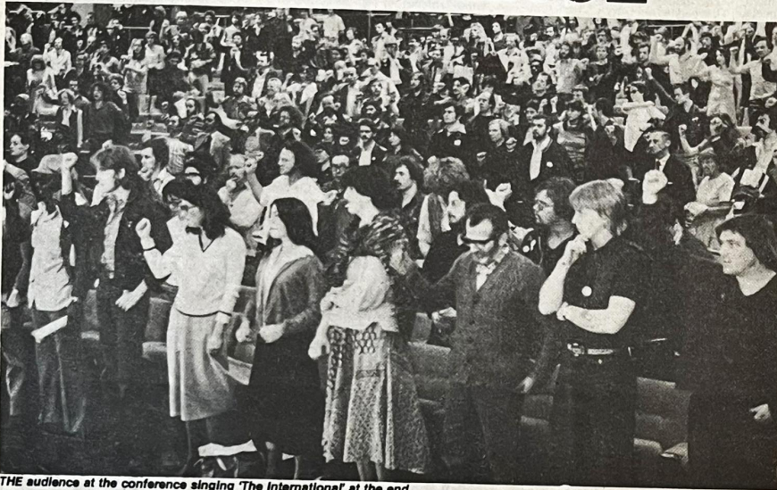
THE audience at the conference singing 'The Internationals' at the end

ON SUNDAY September 17 at the Wembley Conference Centre, the 'News Line', the daily paper of the Workers Revolutionary Party held a conference on the role of the British Armed Forces vis-a-vis the trade unions.