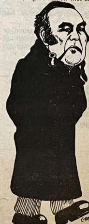
"IF THEY REMEMBER THE THREE MANCHESTER MARTYRS AFTER 111 YEARS HOW CAN I KEEP IT QUIET ABOUT THE H BLOCK 580?"

It remains to be seen how many other members of this theatrical entertainment are similarly suffering from folie-de-grandeur on an international scale.