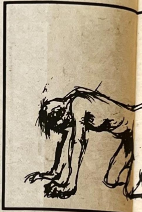
Should we be too slow to shut our windows the hose is inserted and we are hosed down. The jet of water soaks our bedding and the entire cell.

The criminal orderlies and screws dressed in protective nylon overalls hose down the outside and, occasionally, the inside of each wing with a high-powered hose.