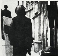
The following incident happened to a family from this district during last week:-

If the Republican News is NOT sold regularly in your area, you can make sure of your copy by becoming a postal subscriber, or if you wish it to be sent to your friends abroad, the subscription rate for six months is £1.75p or better still for one year the rate is £3.50p. Further details may be obtained from the Circulation Manager, 182 Brompton Pk., Belfast BT 14 7LE