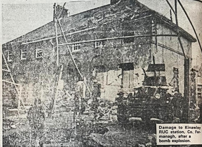
Damage to Kinawley RUC station, Co. Fermanagh, after a bomb explosion.

If public opinion can be made to appear to make the decision, it will be ideal solution for the English Government. Certainly, their present policies seem designed to provoke the Loyalists. The decision not to include Harland and Wolf's shipyard in their recent nationalisation plans is a very significant straw in the wind.