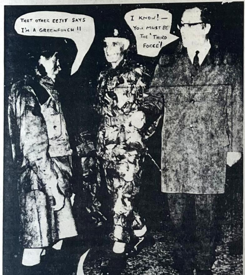
THAT OTHER EETIF SAYS I'M A GREENFINCH !!