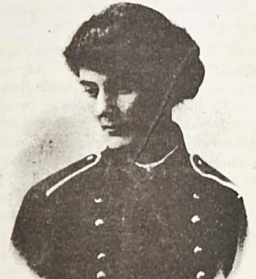
• Countess Markievicz

When the Cease-fire Dump Arms Order was issued in 1923 women continued to play a leading role in the struggle. In 1925 the Easter Lily was introduced by Cumann na mBan as the National Emblem of Commemoration of Ireland's dead. The Easter Lily is still the property of Cumann na mBan and no other body has the right to claim it. For a number of years past the National Commemoration Committee have acted as distribution agents for Cumann na mBan.