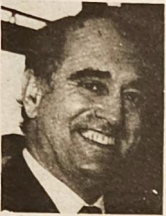
● Brian Mawhinney

A chara, Bheadh muid buíoch duit dá dtabharfá spás duit do chloín litreach le rá go bhfuilimid in éadan amach is amach an chóras oideachais úr atá ar intinn ag an Uasal Brian Mawhinney MP ó thaobh na Gaeilge de.