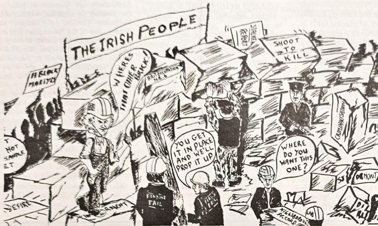
• IRELAND 1989: A tottering colonialism blocks the march of the Irish people.

This is a reproduction of the first Easter Lily given published in 1922