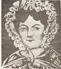
• Anne Devlin

founded in 1913 women were entitled to become members with full rights of equality with the male members. In 1916 they joined in the fighting in all buildings held by the Irish Citizen Army. They also participated in the attack on Dublin Castle. Many of them were wounded during the week's fighting. The Countess Markievicz was one of the first to join. She served as second-in-command to Michael Mallin in the College of Surgeons in Stephen's Green. She was sentenced to death with the other leaders of the Rising but this sentence was commuted to life imprisonment. Released with the rest of the prisoners in 1917, she was elected to the First Dáil in 1919 and became Minister for Labour. She was the first woman in Ireland and England, if not in the world, to be elected a member of Parliament and a Minister of Parliament.