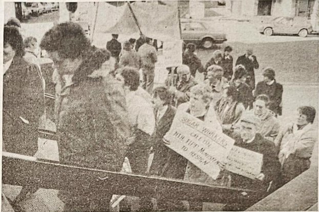
● Picket by Thurles sugar factory workers outside Comhlacht Siúcra Éireann headquarters in Earlsfort Terrace, Dublin on February 16 last.

Some time-serving politicians have even attempted to parade this situation as a virtue, seeking a mandate for "further integration" under the SEA in next June's elections and offering nothing more consoling to endangered Irish workers and the quarter-of-a-million unemployed than some main-road develop-