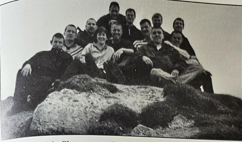
Baill de Chumann na Fuiseoige ar bharr Earagáil

(ii). na cimid seo a iomlánú i bpobal na Gaeilge