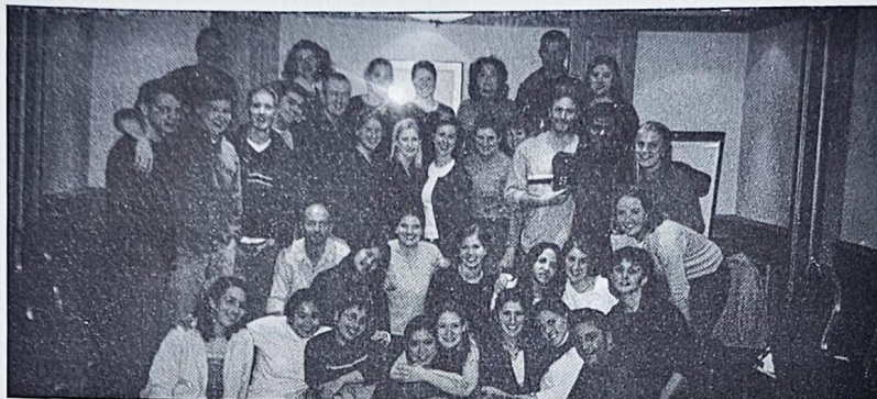
An Evaluation Session during the tour