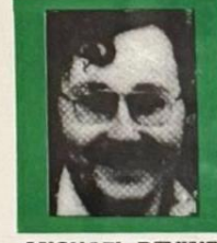
MICHAEL DEVINE DERRY CITY 20th August, 1981. Aged 27. (60 days)

Is beannaithe iad sin ar a mbíonn ocras agus tart ar son na córa óir is Leo Ríocht Neimhe.