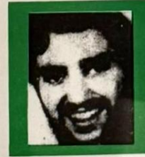
PATSY O'HARA DERRY CITY 21st May, 1981. Aged 24. (61 days)

Is beannaithe iad sin ar a mbíonn ocras agus tart ar son na córa óir is Leo Ríocht Neimhe.