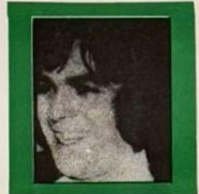
JOE McDONNELL BELFAST 8th July, 1981. Aged 30. (61 days)