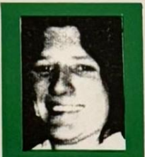
BOBBY SANDS, M.P. BELFAST 5th May, 1981. Aged 27. (66 days)

Our sacrifice is for the dignity of Irishmen and Irishwomen who struggle for the freedom of Ireland