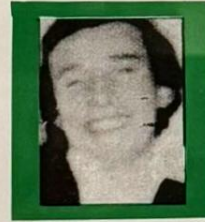
RAYMOND McCREESH SOUTH ARMAGH 21st May, 1981. Aged 24. (61 days)